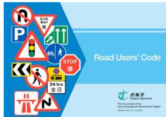
Road Users' Code