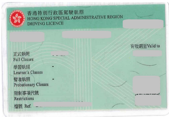
Full Driving License (front)