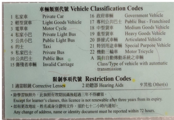
Full Driving License (front)