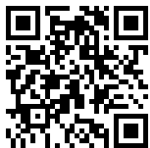
ImmD website QR Code

Please scan the following QR codes to visit the relevant website: