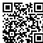
GovHK website QR Code

Immigration Department The Government of the Hong Kong Special Administrative Region April 2023